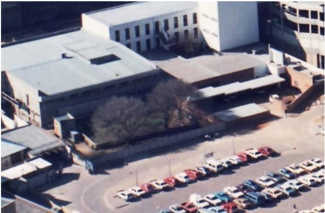
Voortrekker Street Cemetery, Alberton