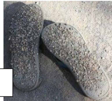
Crocks and flip flops are not graveyard shoes!

It pays to plan your visit to a cemetery in advance. Our visit to the Victoria West cemetery was unplanned and we paid the price. We ended up in the graveyard when the sun was at its hottest. The temperature reading in the car was 37 degrees in the shade, when we finally got back to the car.