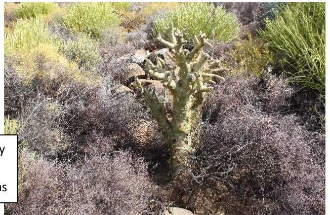
The Karoo bushes are hard, dry and many of them covered with thorns. We all returned with huge scratches on our arms

In many instances we had to walk long distances to get to the cemeteries. Reports were received of a cemetery up the Langkloof. The road was blocked off about 3km from the sighting. We went through the veld, across the river beds, up and down the mountain side, we found the ruins, but not the graves!